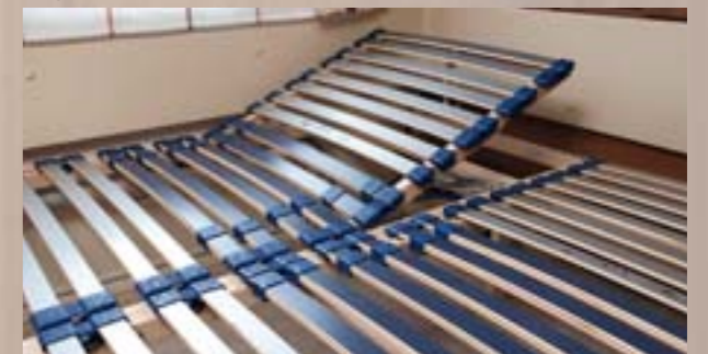
Divided slatted bed frame with height-adjustable head section.