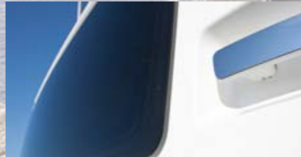
Integrated, stable grab handles at the left and right rear side , shaped pleasantly and ergonomically.