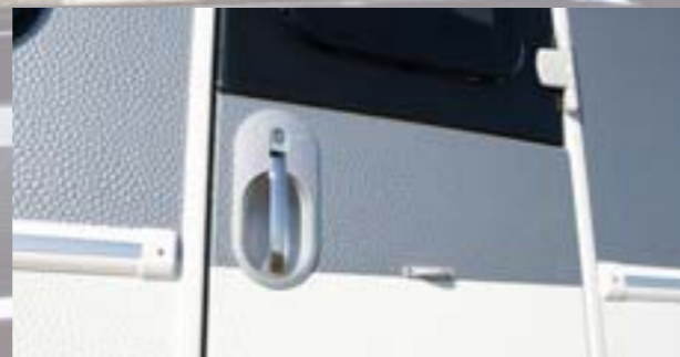
Practical entrance door with single-key locking system for all locks. The illuminated door "Brillant" ensures safe entry.