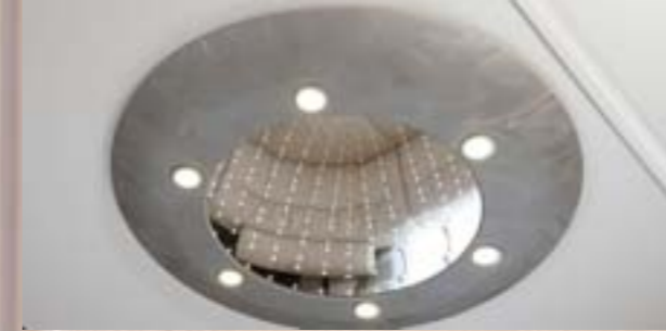
New type of 3-D night-sky ceiling module.