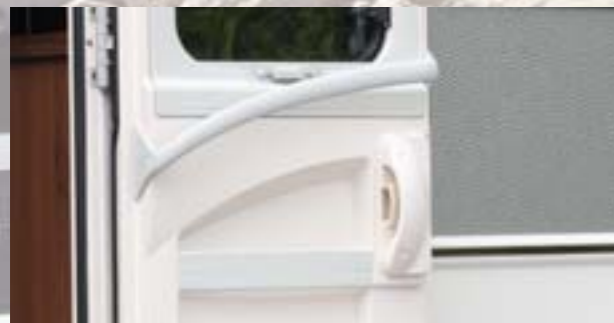
Inside doorhandle , integrated entrance door with awning lamp, rubbish bin on the inside of the door and an integrated window to be opened completely with shade and fly screen.