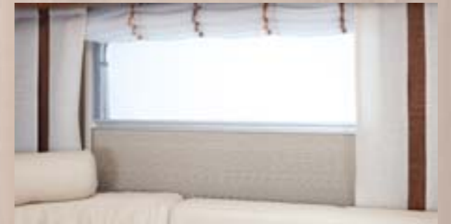
Window soft screen in pleats design with material-protecting and low-noise return dampers.