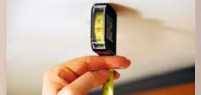
Headroom 1,950 mm (6.3 ft.) , thus feel of generous space. The blinds which have been mounted at a higher point ensure a pleasant view through the window.