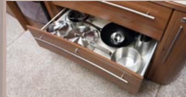
Kitchen with large drawers that include a self closing mechanism