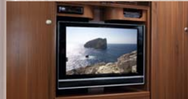
Multimedia cabinet for radio, 26" TFT TV set, receiver and DVD (650 TF and 700 TFD).