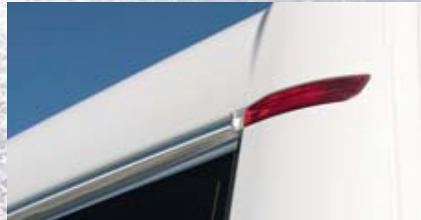
Combined LED tail and braking lamp , thus ensuring triple safety in road traffic.