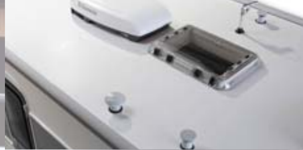
Glass-fibre reinforced roof with improved hail protection.