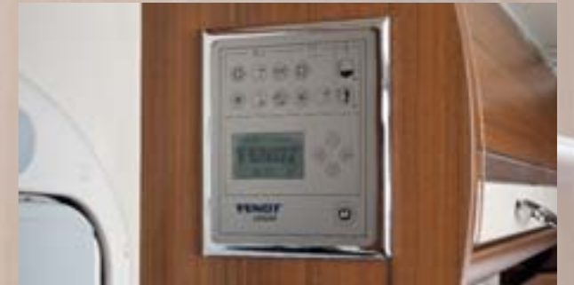
Central switch panel in the entrance area for light, water level indicator, time/clock, temperature and underfloor heating