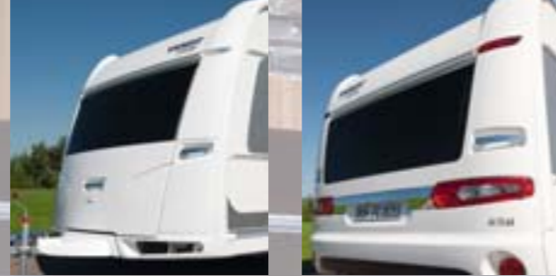
Front and rear made by LFI process (method to process fibre-reinforce polyurethane systems), especially stable and resistant.