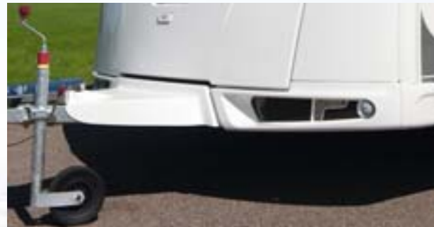
Support wheel with harder rubber cover and load indicator for easy control of the support load.